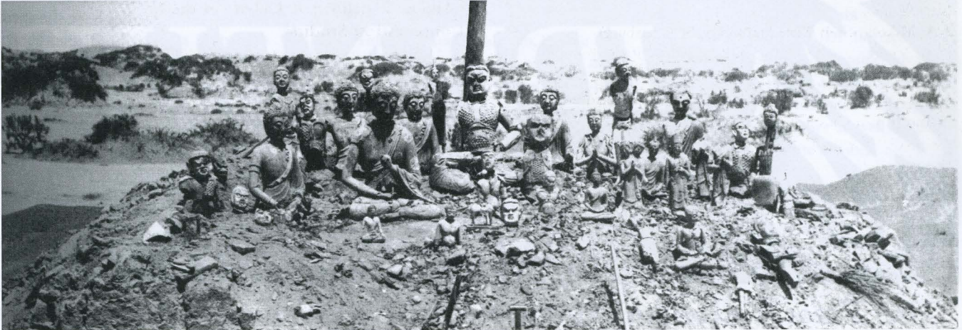
The excavated stupa at Kharakhoto showing some of the Tangut statuary discovered there in 1909 by the Russian expedition.

As planned, the conference devoted to the preservation of the materials discovered in the first quarter of this century by European, Russian, Chinese and Japanese scholars at the Mogao Caves (Dunhuang), in the ruined city of Kharakhoto, and in the oases of Eastern Turkestan (Turfan, Kucha, Khotan and others) was held between September 7-12, 1999 in St. Petersburg.